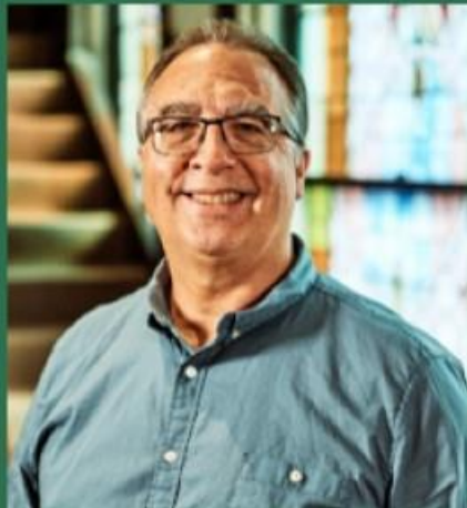
Pat Wester Church Revitalization