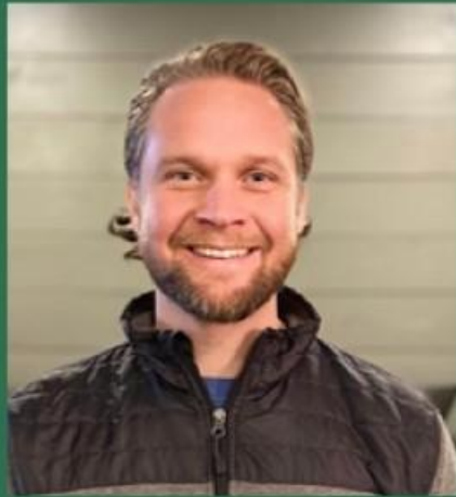
Andrew Peterson Park Community Church