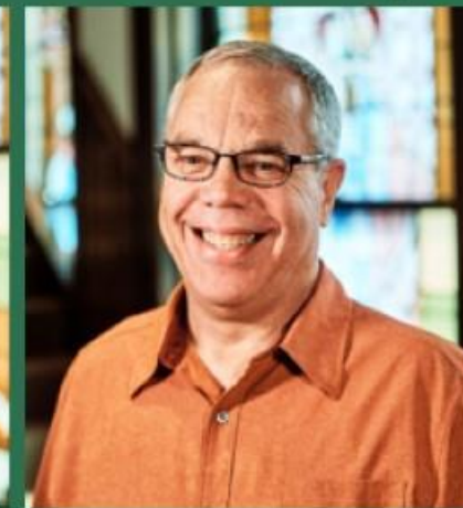
Dan Moose Church Multiplication